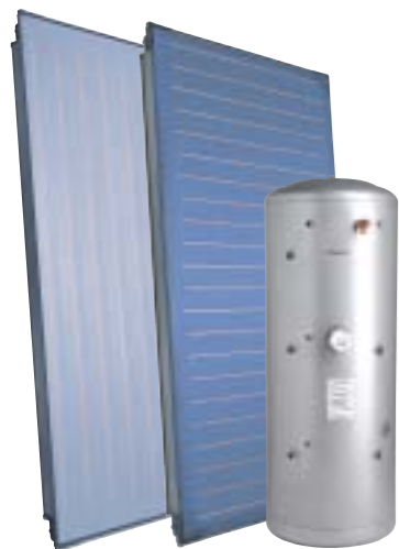
Greenskies FKC solar panel and Greenskies FKT high performance solar panels can be complemented with Greenskies twin-coil hot water cylinders with capacities of between 180 and 300 litres.